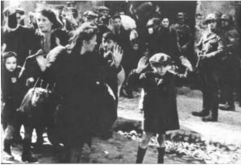
Figure 1. Photographer unknown, Warsaw Ghetto (1943). From the Stroop Report .

jects, its detail, and its unrehearsed documentary character (conveyed, for example, by the somewhat haphazard organization of the human figures as well as the multiple directions of their gazes), it suggests the truth or actuality of these events. Moreover, because of the clear power discrepancies between the victimizers and the victims (emphasized by the prominence of Jewish women and children in the photograph), it (still) provokes outrage at Nazi atrocities. By selecting the most innocent victims of the Holocaust—the children, who in no way could be considered combatants—it shows the utter senselessness and viciousness of the Nazis' projects. Furthermore, as Marianne Hirsch has argued, the image of the child encourages viewer identification and projection. 14 Such images, she argues, can open up spaces for "postmemory," acts of spectatorial identification with the oppressed other, which do not either stereotype or fully assimilate him or her, and that help those who were born after the events develop an open and ethical relationship to the past. 15