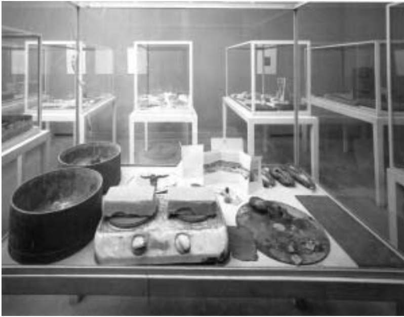
Figure 2. Joseph Beuys, Auschwitz Demonstration [ Auschwitz Demonstration ] (1968). Vitrine with sculpture and objects (1956 to 1964). Hessisches Landesmuseum, Darmstadt. Copyright 2003 Artists Rights Society (ARS), New York/VG Bild-Kunst, Bonn.

such representations often juxtapose different historical time frames and forms of signification—juxtapositions that provoke their spectators to compare and contrast different temporal and spatial contexts. “Reflexivity” here means physical and existential viewer self-consciousness evoked by a particular set of visual and linguistic signifiers—a self-awareness that asks the viewer to engage with the artist’s representation and its relationship to the environments and life contexts to which it refers and through which it passes. As such, reflexivity is connected to the attempt to dissolve art into life and, thus, potentially, has political consequences.