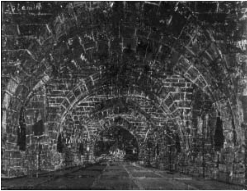
Figure 4. Anselm Kiefer, Shulamith [ Sulamith ] (1983). Oil, acrylic, emulsion, shellac, and straw on canvas, with woodcut. 114 3 / 16 × 145 1 / 16 inches. Saatchi Collection, London. Copyright 2003 Anselm Kiefer.

how it can transform itself into an entire range of opposites, including, but not limited to, “abstract surface,” “drawing,” “language,” and “natural object.” And in this way, the formal and existential reflexivity produced by Kiefer’s work interacts with its undecidable citations to suggest both the difficulties and the necessity of remembering and depicting the past. Historical trauma, Margarete suggests, cannot be represented unequivocally or even statically. It can—and must—change over time. By working through the dense network of cultural representations that connect the present day with the past, however, those who come after may remember and commemorate monstrous and largely unrepresentable events of historical trauma through representations that acknowledge—and thereby contribute to—a process of continuous dialogue and investigation.